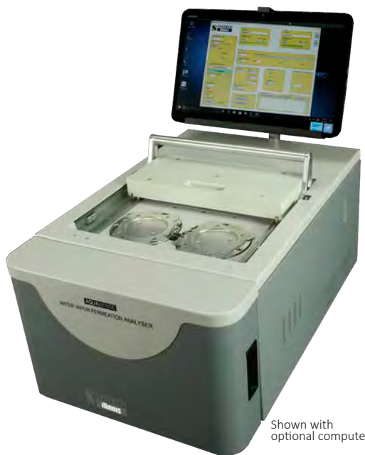
Shown with optional computer

Coulometric sensor technology ASTM F3299-18 compliant